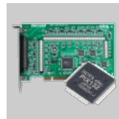
MC8042P / MC8022P